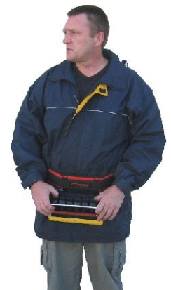
The small design allows unhindered bending down