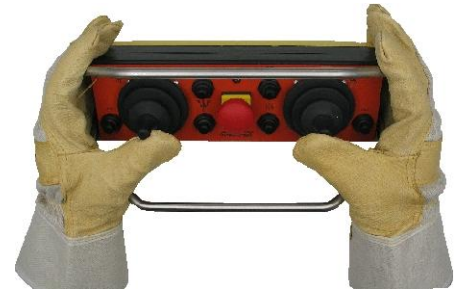
Easily operated with gloves