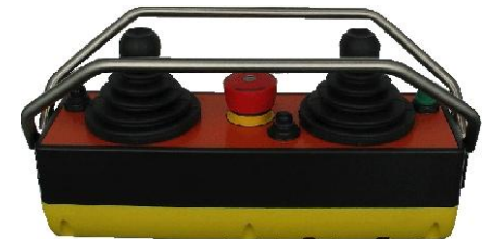
Extremely small design