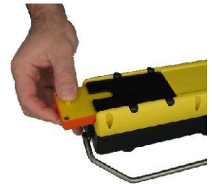
7,2V Power pack